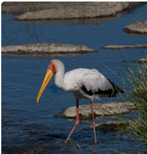
SANDRA VOGL STEIN

Spend six nights under canvas at our mobile tented camp. Our exclusive private campsite features large, cabin-style walk-in tents with flush toilets and hot-water showers. A community dining area offers delicious food, accommodating a wide variety of tastes and needs. Enjoy drinks and fall asleep to the sounds of lions and hyenas proclaiming their territories. (B,L,D Daily)